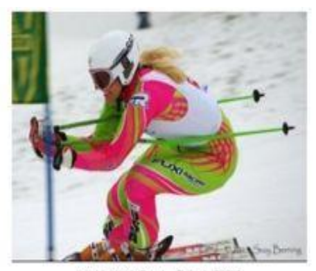
HAVING A BLAST!