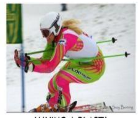
HAVING A BLAST!