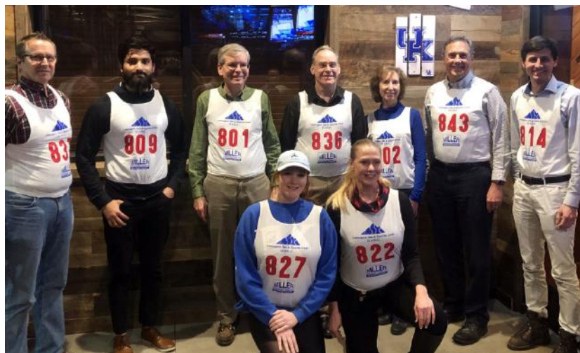
The 2019 LSSC Racing Team