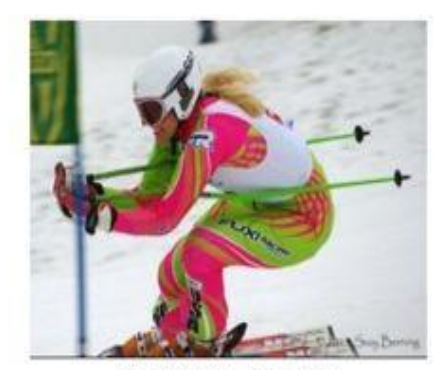
HAVING A BLAST!