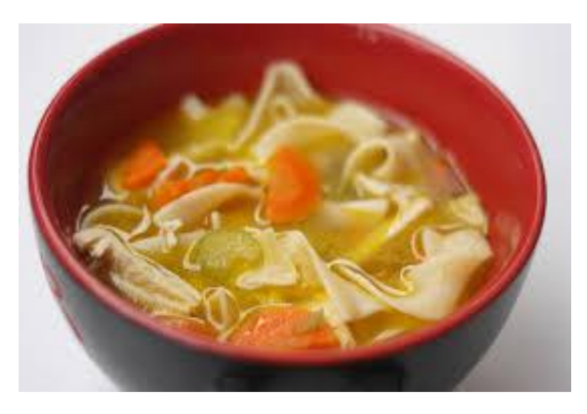
Time: 6:30 pm

Bring your own beverage and, if you wish, a side to share that goes with soup.