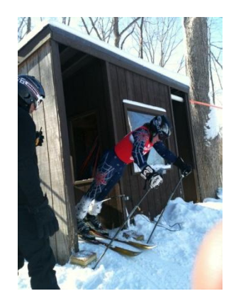
A great start!