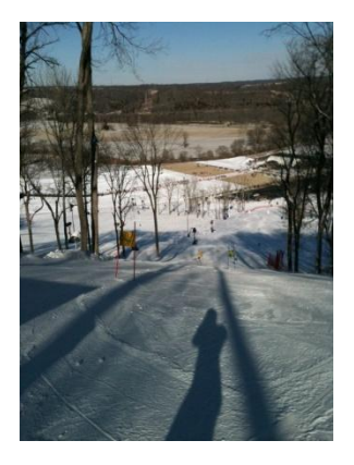
A view of the course.