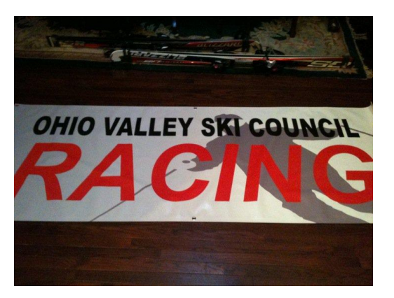
Come support your team at the next race, Jan 22<sup>nd</sup> & 23<sup>rd</sup> At Paoli Peaks