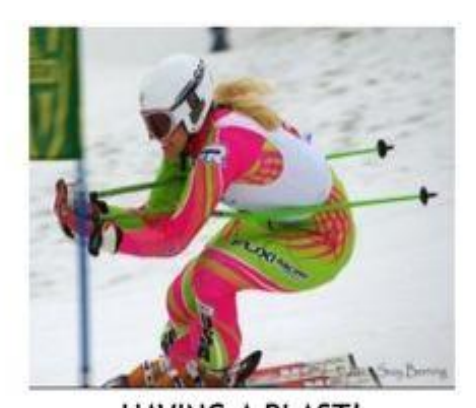
HAVING A BLAST!