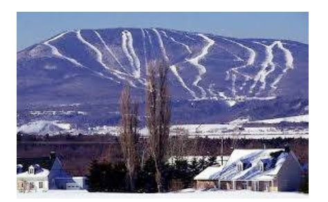
Mt. St. Anne