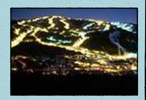
Dercum Mountain (Front Side)

tours with catered meals; into Payments: Aug. $100; Sept. $275; Oct. $275; Nov. $275; Dec. Independence Bowl; great place $170. To make your deposit payment, click here: http:// www.lexskisports.org/2015-whistler-trip