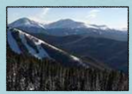
The North Peak