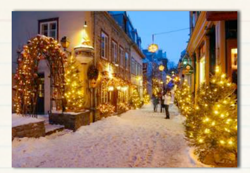
Old Quebec City