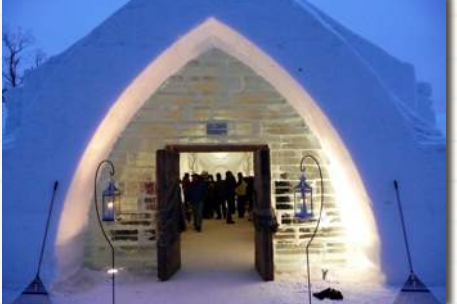
The Ice Hotel